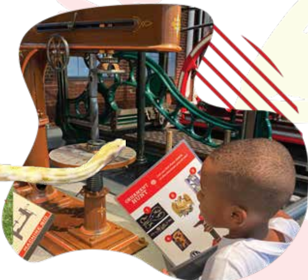
The National Museum of Industrial History works to inspire tomorrow's inventors by teaching them the vital role that the Lehigh Valley served in building America.