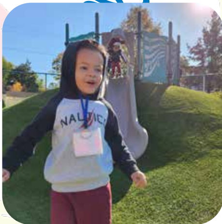
The upgraded playground at LVCC South Mountain can fuel a child's imagination, with tunnels, bridges, hills, slides, and a "river" that surrounds the central play area.