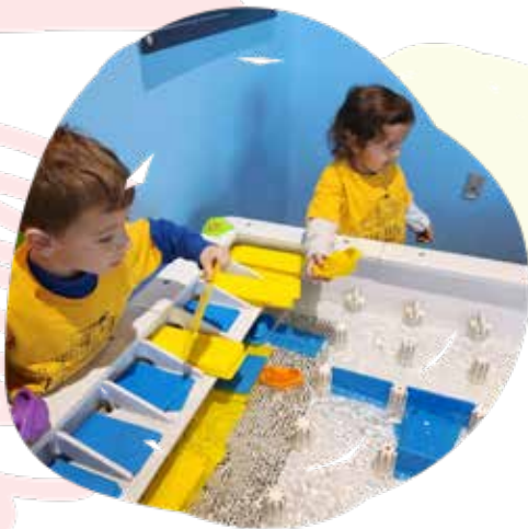
Children learn about the power of water at the Da Vinci Science Center