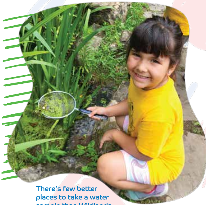
There's few better places to take a water sample than Wildlands Conservancy

A few programs and activities experienced this year included visits to the Da Vinci Science Center, The National Museum of Industrial History, Wildlands Conservancy, National Canal Museum, and many more!