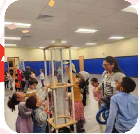
Two indoor gyms at 555 Union Blvd means it's playtime year round.