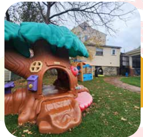
Infants and toddlers join in on the fun too with their own dedicated playgrounds.