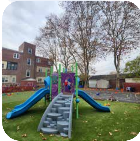
The new playground at LVCC Campus perfectly compliments the surrounding area's nature filled walking trails.

Our new facilities and play spaces represent our commitment to providing the highest quality educational environments while keeping access to childcare equitable, accessible, and affordable.