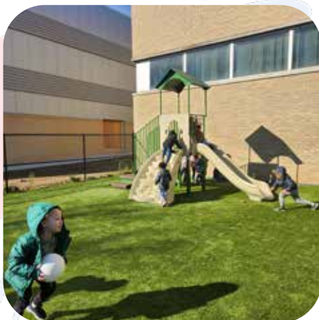
The new preschool to school age playground at 555 Union Blvd provides ample of room for children to run, jump, and climb!