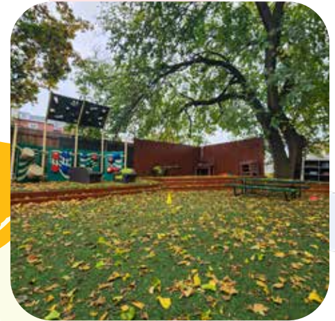
The playground at LVCC Fowler features a raised stage where children can reenact their favorite stories.