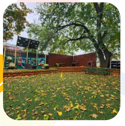
The playground at LVCC Fowler features a raised stage where children can reenact their favorite stories.