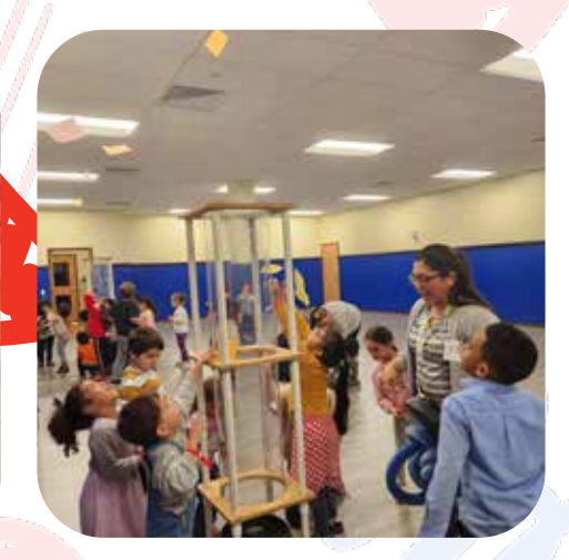
Two indoor gyms at 555 Union Blvd means it's playtime year round.