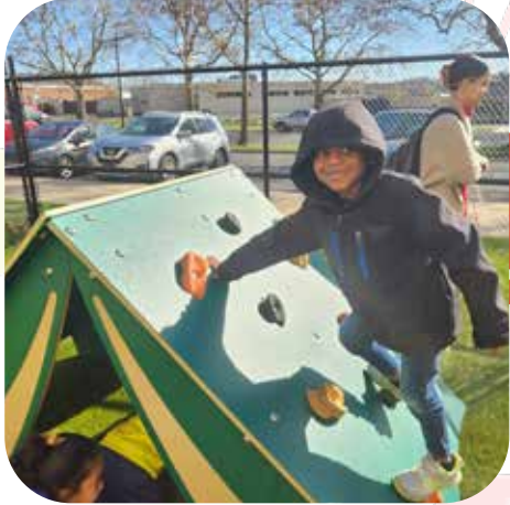
The new preschool to school age playground at 555 Union Blvd provides ample of room for children to run, jump, and climb!