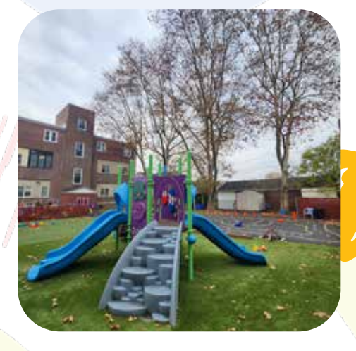
The new playground at LVCC Campus perfectly compliments the surrounding area's nature filled walking trails.

Our new facilities and play spaces represent our commitment to providing the highest quality educational environments while keeping access to childcare equitable, accessible, and affordable.