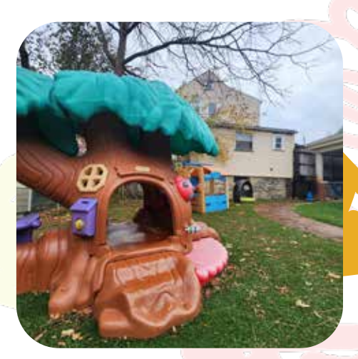
Infants and toddlers join in on the fun too with their own dedicated playgrounds.